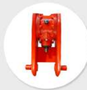
Special Hitch Mounting