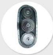
Heavy Duty Side Gear Drive