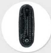
High-Tensile Side Chain Drive