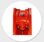
Oil Bath Transmission