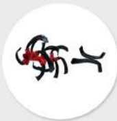
Sturdy Rotor Shaft with J Type Blades