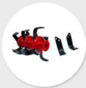
Sturdy Rotor Shaft with L Type Blades