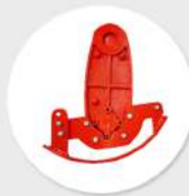
Skid Base Depth Adjuster