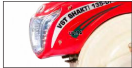
State Of The Art Led Head Lamps