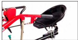
Comfortable Seat (optional)