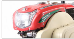
State Of The Art Led Head Lamps